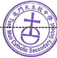
Wong Kit Principal

The due date for the reply slip: 7 th October