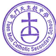
Wong Kit Principal